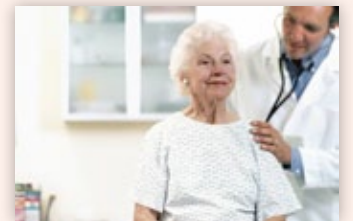
Parkinson (Apomorphine hydrochloride)