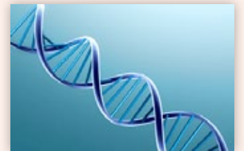
Immunity Deficiency (Globulin)